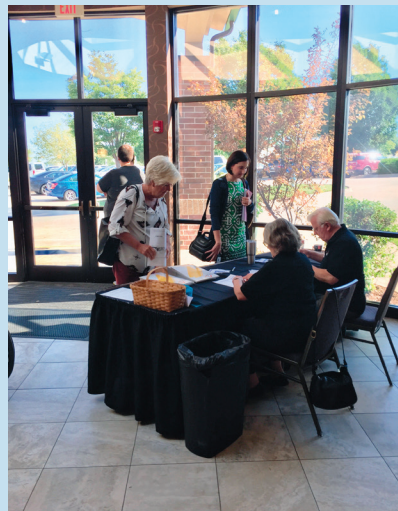
Arc board members greet guest.